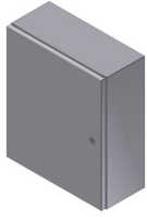
SW—Wall Mount Enclosure without bolt on wall brackets.