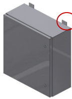
SW—Wall Mount Enclosure with bolt on wall brackets